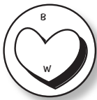
Practice the Perfect Presence

Without the Presence of God behind them 'Practical Means' have no power.