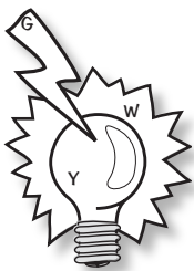
Perfect Faith is instantaneous manifestation

The Presence of God plus 'practical means' produces a 'power for good' in our lives,